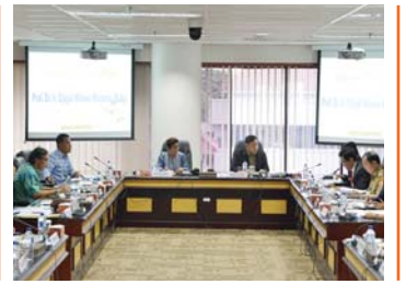
Sovereignty, Sustainability and Prosperity Required to Become Maritime Country page 6